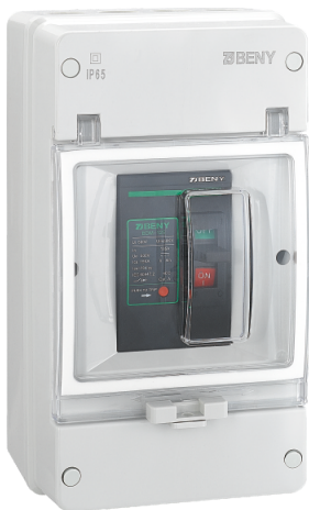
BDM-125 with IP65 Enclosure